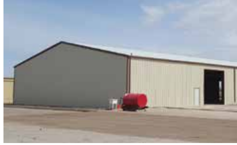
Roof and wall repair and replacement