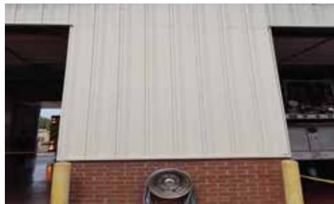
Damage restoration of panel and roll up door frame