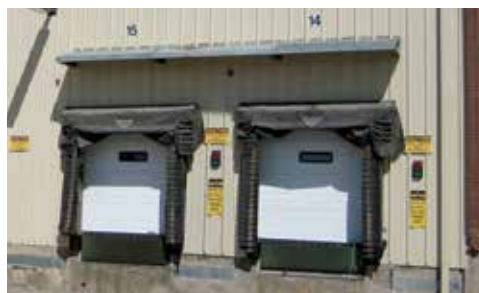
Loading dock bay door frame repair and replacement