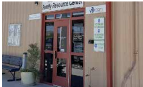
Roll up door conversion to entrance door